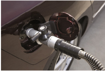
Figure 3: Honda FCX Clarity refuels hydrogen, State-of-the-Art in 2007.