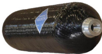
Figure 2: Hydrogen tank, type 4 (plastic liner and composite wrapping). Source: Hexagon

Transferring compressed hydrogen from an arbitrary tank A into tank B consists of emptying tank A and filling tank B. Emptying tank A cools down tank A, even excessive cooling may occur when emptying a large tank such as used for hydrogen trailers. The filling process on the other hand creates heat which can lead to overheating of tanks made of composite material. Overheating is critical for both small and large tanks in various applications such as filling transportable containers, onsite storage tanks or when refuelling vehicles.