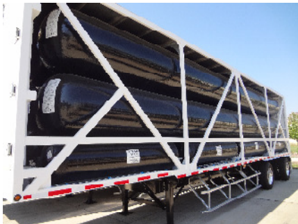
Figure 4: Hydrogen trailer with large storage tanks.

To better understand the thermal behaviour of the tanks, a thermodynamic model based on the MC Method will be developed. The results obtained with this model will then be compared to those obtained from experiments to validate its accuracy.